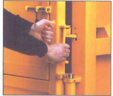
A strong safety lock ensures that the door opening is gradual.